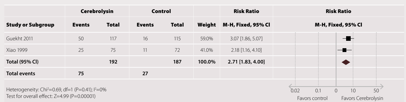
Fig. 6. Forest plot of comparison: Global function, outcome: The improvement of global function reported as responder rates

Only non-serious adverse events were observed in the included trials, and there was no significant difference in occurrence of non-serious side effects between groups (RR 0.97, 95% CI 0.49 to 1.94). Major results are presented on Fig. 7.