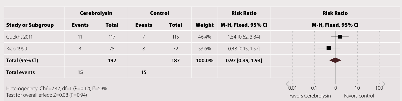
Fig. 7. Forest plot of comparison: Adverse events, outcome: Non-serious adverse events

Only non-serious adverse events were observed in the included trials, and there was no significant difference in occurrence of non-serious side effects between groups (RR 0.97, 95% CI 0.49 to 1.94). Major results are presented on Fig. 7.